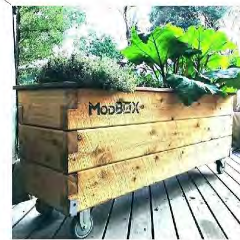
Free standing planter providing separation between terraces