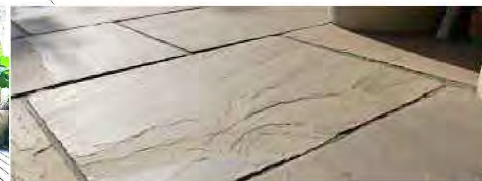
Indian sandstone paving